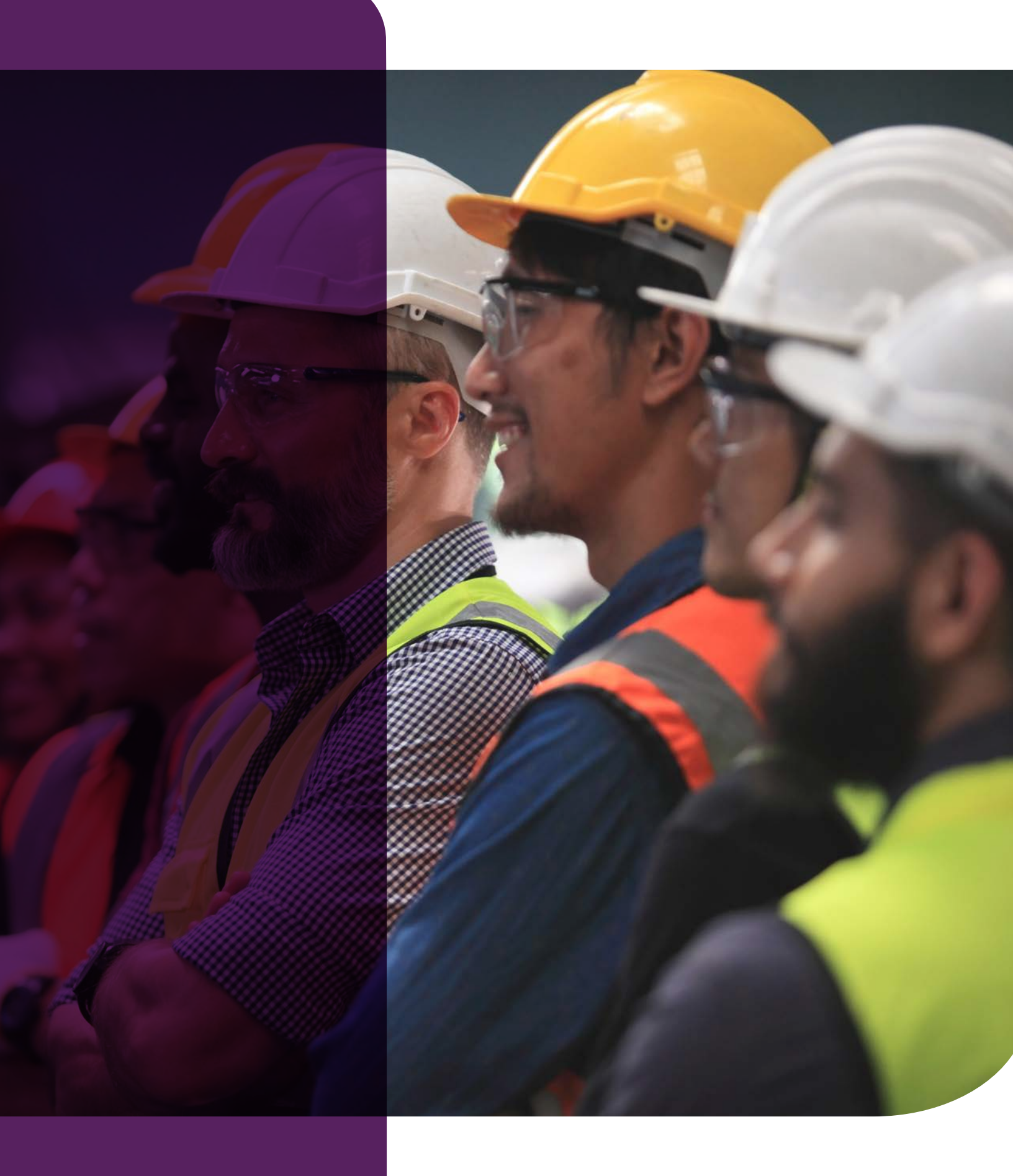
way to quit,